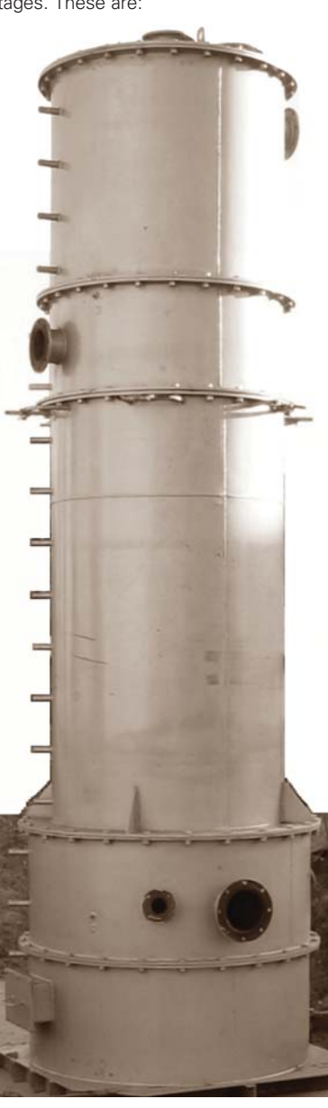
A diagram of the internal structure of the plasma reactor (left) and a photo of a reactor.

The treatment of radioactive waste in the plasma reactor transforms it in several stages. These are: